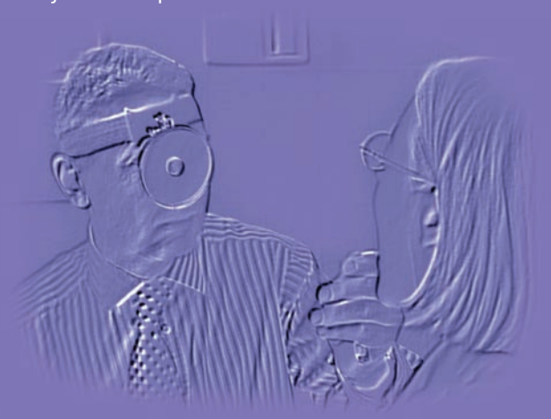
ENT UK The Royal College of Surgeons of England 35-43 Lincoln's Inn Fields London WC2A 3PE

ENT UK is the professional Association for British Ear, Nose and Throat Surgeons and related professionals. This leaflet provides some background information about rhinoplasty. It may be helpful in the discussions you have with your GP or specialist when deciding on possible treatment. This information leaflet is to support and not to substitute the discussion between you and your doctor. Before you give your consent to the treatment, you should raise any concerns with your GP or specialist.